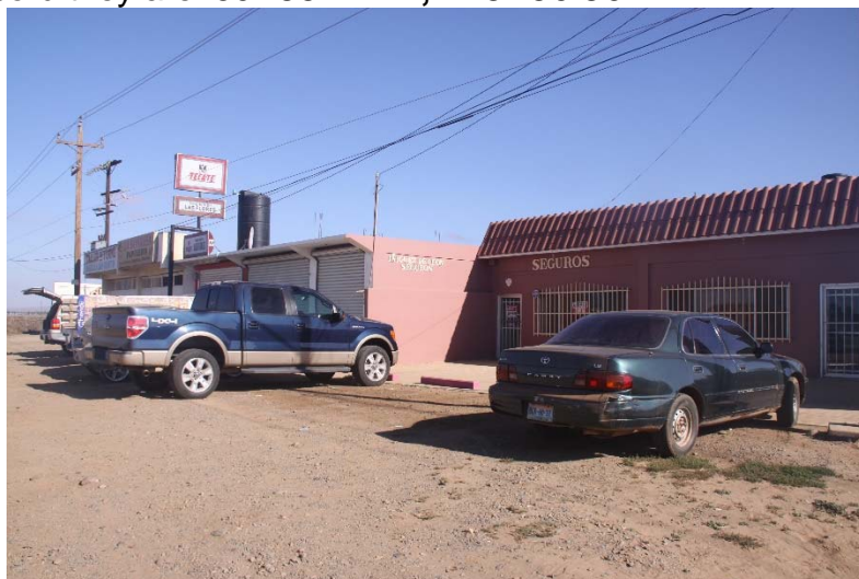
The Insurance Agent's building