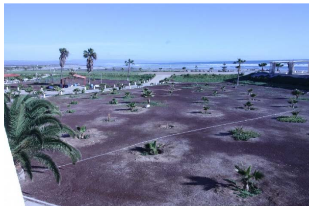
View from the hotel room

Since it was early some providers decided to take advantage of the sunny weather and walk the beach. I don't think many actually went in as it was a bit cool.