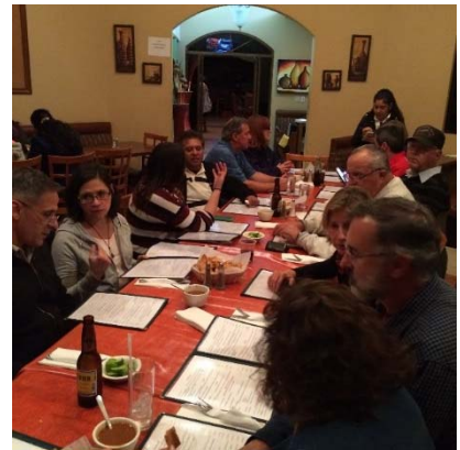
Dinner at Los Jardines