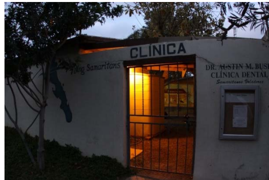
The Clinic at Night