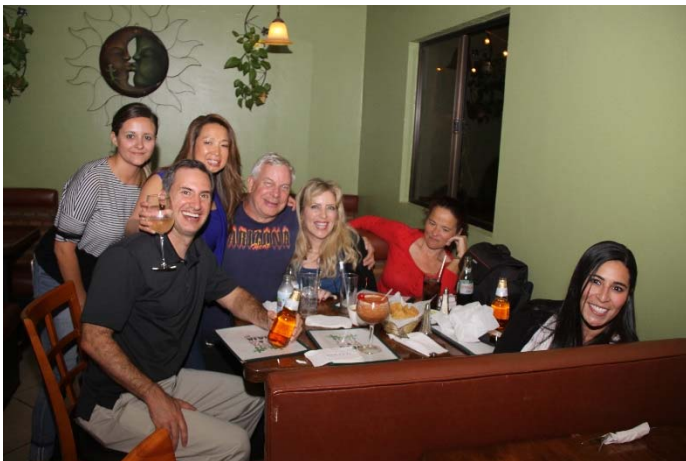
Dinner at Jardines with a couple of Mother Loders