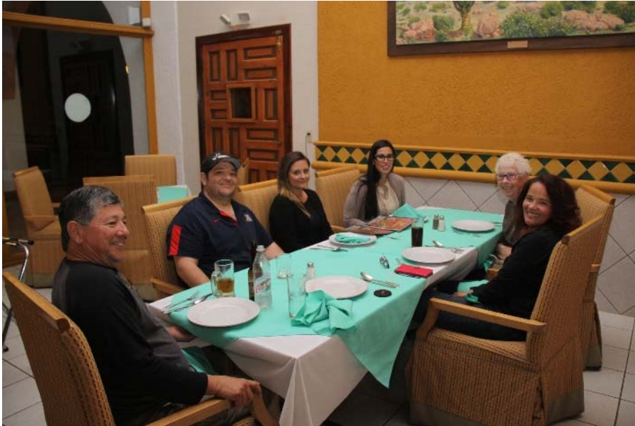
Dinner at the Hotel