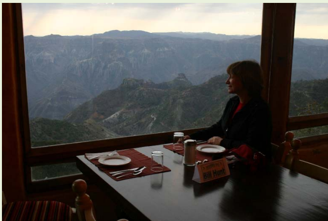
View from the Restaurant

More information will be coming out about this trip later in the year.