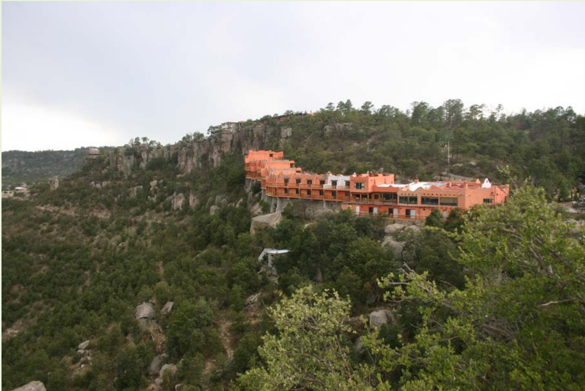
Hotel Divisadero Barrancas

The Corporate's Board next meeting will be held at the end of January. Occasionally the board holds meetings in some very nice resort type areas and encourages members of both chapters to attend. The meeting in January is such a meeting. Being held in the Copper Canyon of Mexico, it includes the train ride from El Fuente to El Divisadero. We'll be staying at the Hotel Divisadero Barrancas, which is built into the side of the canyon. This is a wonderful trip and adding to the great scenery you'll also get a chance to meet other Flying Samaritans members from both chapters. I would like encourage you to go.