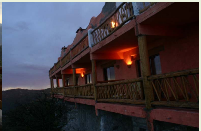
On the Edge of the Canyon